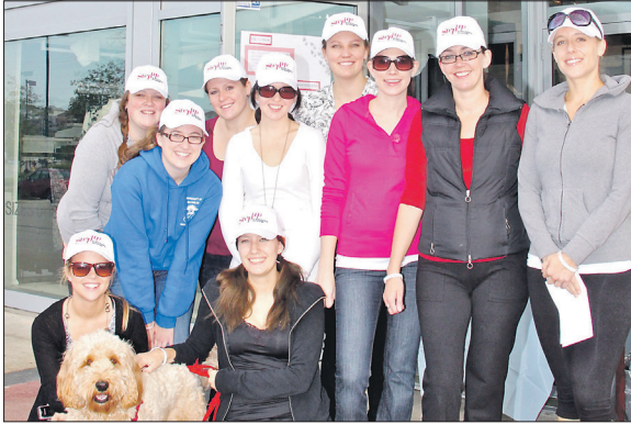
The Ricki's staff at Sunrise Location get ready to roll